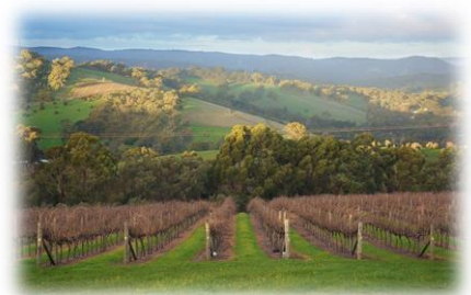
Angel Gully Vineyard in Clarendon