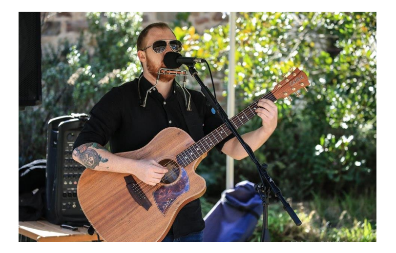
Clarendon – a bit busier than usual