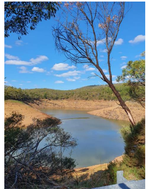
Low tides at Mt Bold