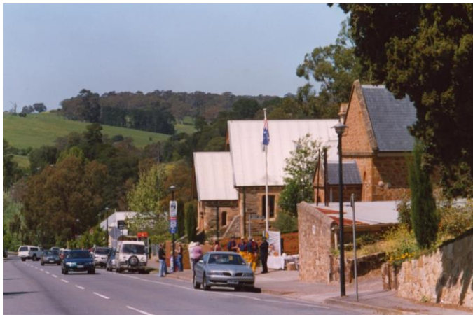
This is a photo of the flag flying outside museum during an Election Day when they were held at museum

The Australian Flag has flown proudly out the front of the Clarendon Museum (former Christian Bible Church) for almost 100 years. You may not have noticed that the flagpole has recently been replaced. As a state heritage listed building, a special-order replica flagpole had to be made in Victoria. A specialised trailer was required to transport the flagpole so that the wood would not be tied down too hard and cause warping.