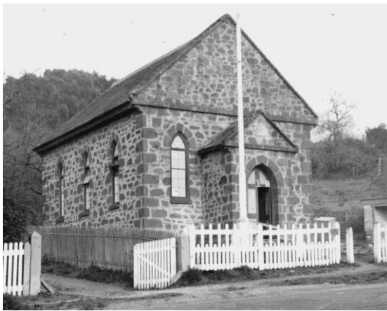
One earliest photos of flagpole 1933

The Australian National Flag is the foremost symbol of our nation. The flag's role, like that of all national flags around the world, is to unify the nation as it belongs to all Australian citizens equally. As one of Australia's most important symbols, the flag has to be treated with dignity and respect. The Department of the Prime Minister and Cabinet has an exhaustive collection of resources detailing the many protocols for handling and displaying the Australian Flag. It even describes the proper way to dispose / decommission the flag.