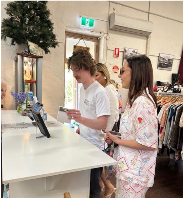
A photo of some of our happy rally visitors – thanks for calling in!

If you would like to know more or get involved in our community Op Shop please contact us via email at opshop@clarendon.org.au